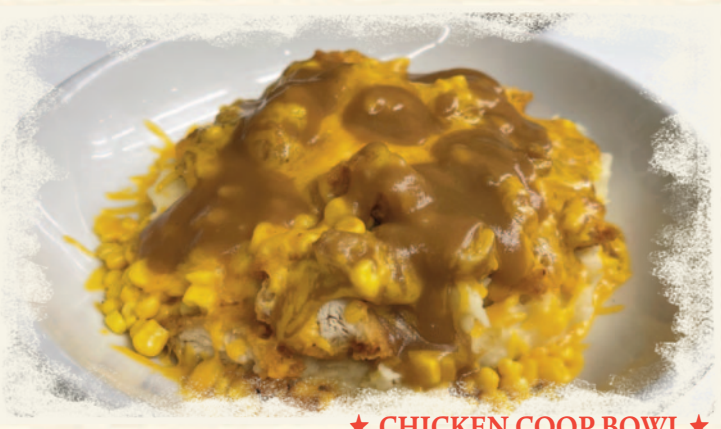
★ CHICKEN COOP BOWL ★